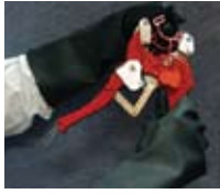
▲ Crimping tool/crimps

Accessories and support equipment include a lifting stand to help support the larger canister size, crimps and the FlexLoc™.