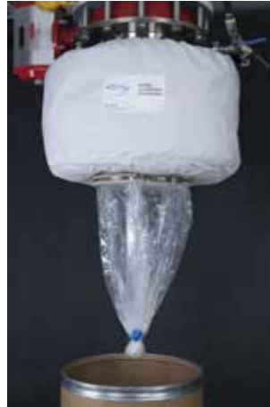
Continuous Liner System