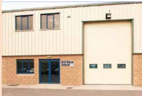
ILC Ireland facility