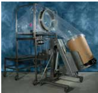
DTS-Drum Transfer System