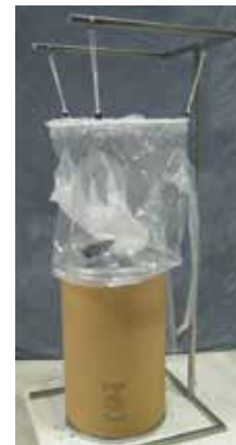
DSE-Drum Sampling Enclosure