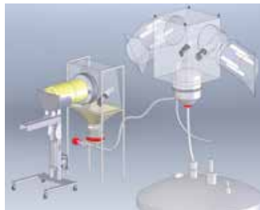
VTS-Contained Drum Transfer